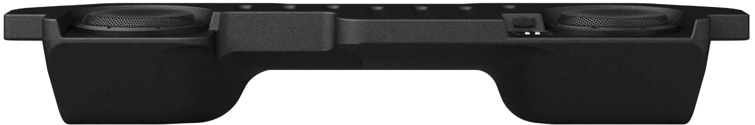
Rear of Enclosure