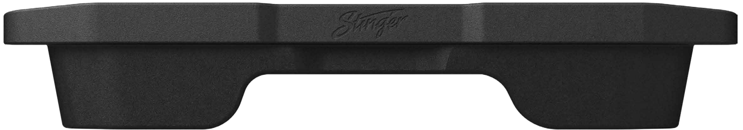
Front of Enclosure

Intensify Your Truck's Audio Experience with this Custom Dual 10" Sealed Subwoofer Enclosure!