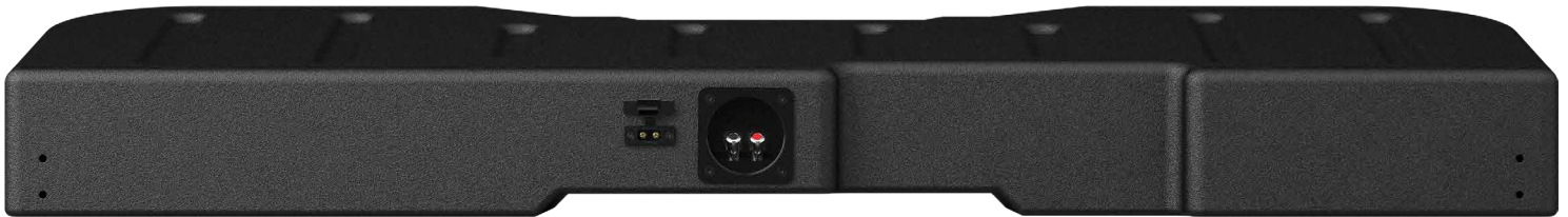
Rear of Enclosure