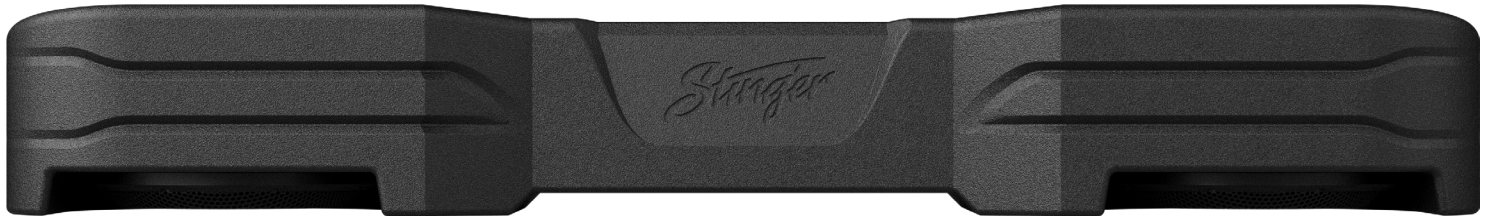
Front of Enclosure

Intensify Your Truck's Audio Experience with this Custom Dual 10" Sealed Subwoofer Enclosure!