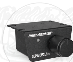
ACR-1 Remote Level Control Included

The Bass Restoration circuit inside The Epicenter is designed to reproduce low frequency information by looking at the upper frequency ranges and detecting musical harmonics. These harmonics then allow The Epicenter to drop down a few octaves and reproduce the "missing" bass notes.